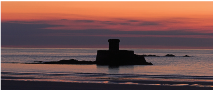
La Rocco Tower