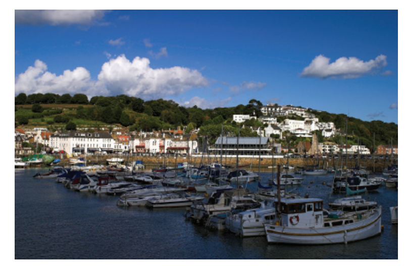
Harbour, St Aubin